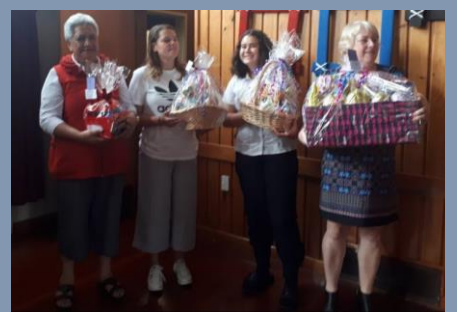
Congratulations to our winners of the Senior Ball Committee's Easter Egg Raffle. A spectacular achievement, managing to provide 7 prizes.